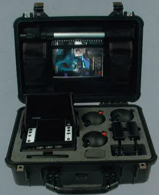
Accessories Kit (Optional) ▼